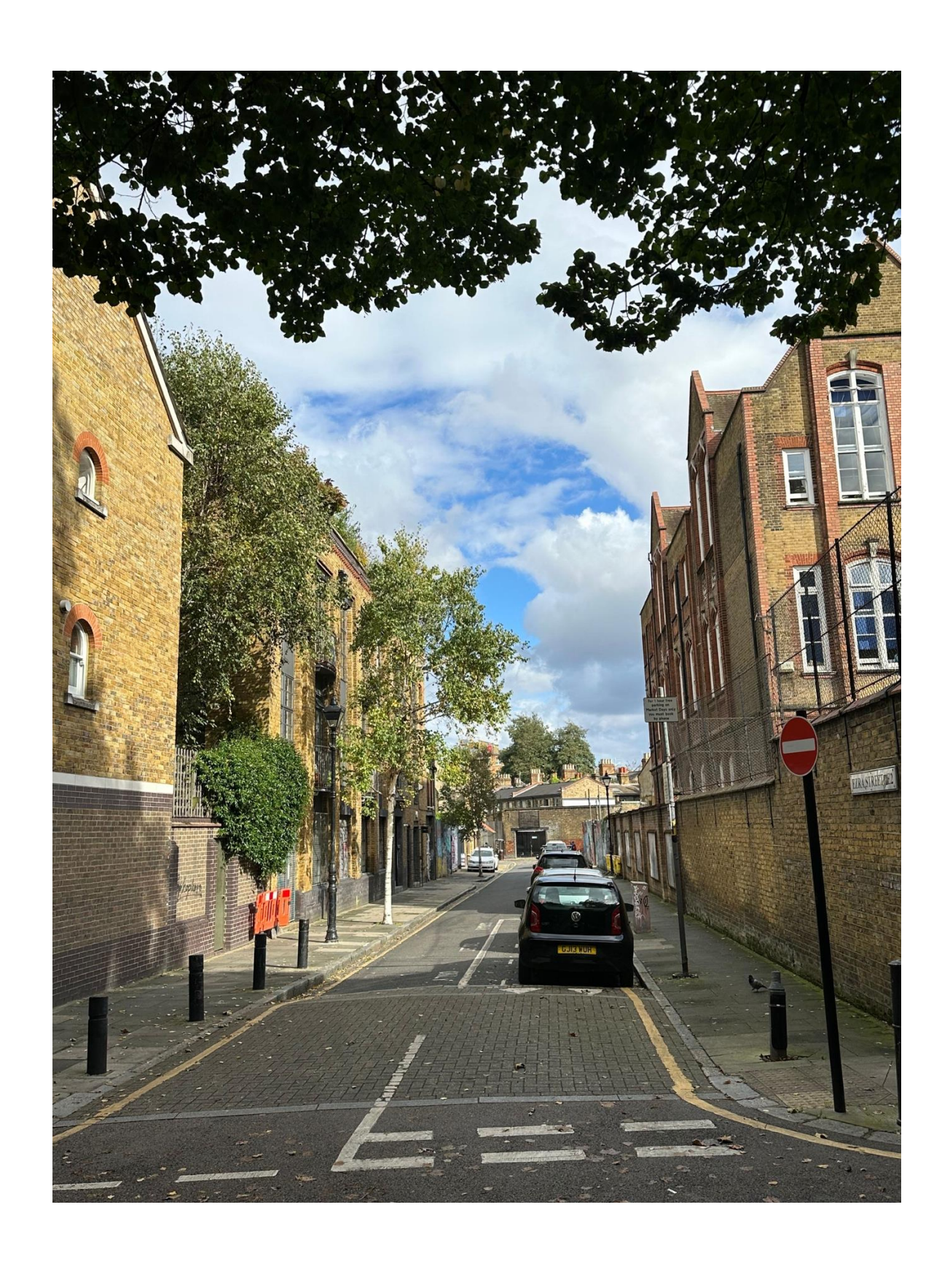
Blackbird Yard to the left, 'Bold' property to the right