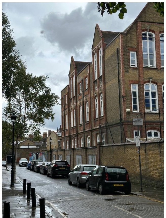
View from outside 'Solid Floor' looking towards Ravenscroft Street. 'Bold' building to the right, Blackbird Yard out of view beyond.