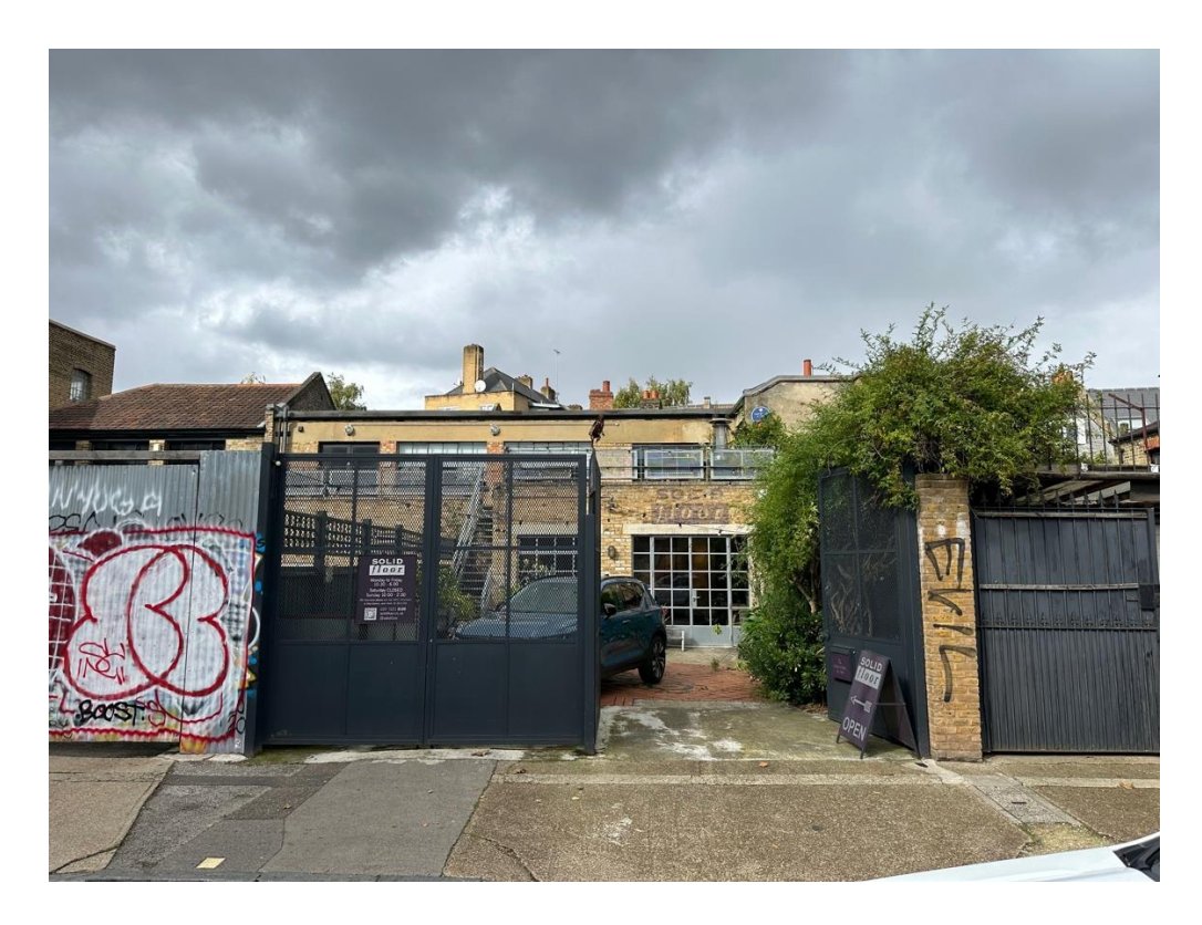
View from 'Solid Floor' balcony onto Ezra Street