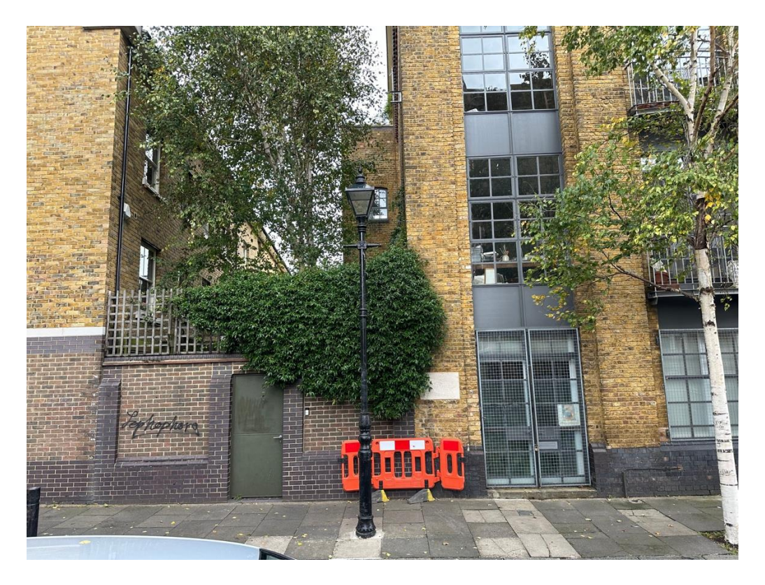
Blackbird Yard from Ezra Street