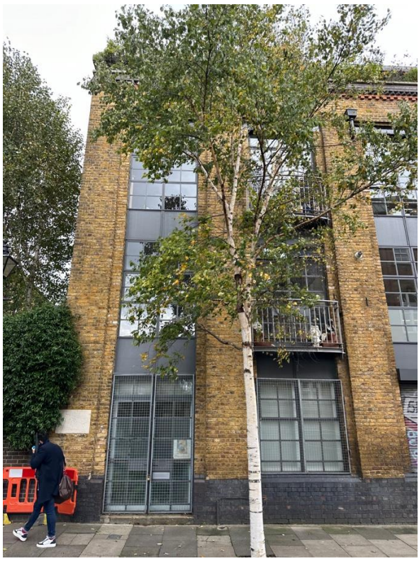
This runs approximately 2/3 the length of Ezra Street opposite Blackbird Yard, 'Bold' and the applicant premises