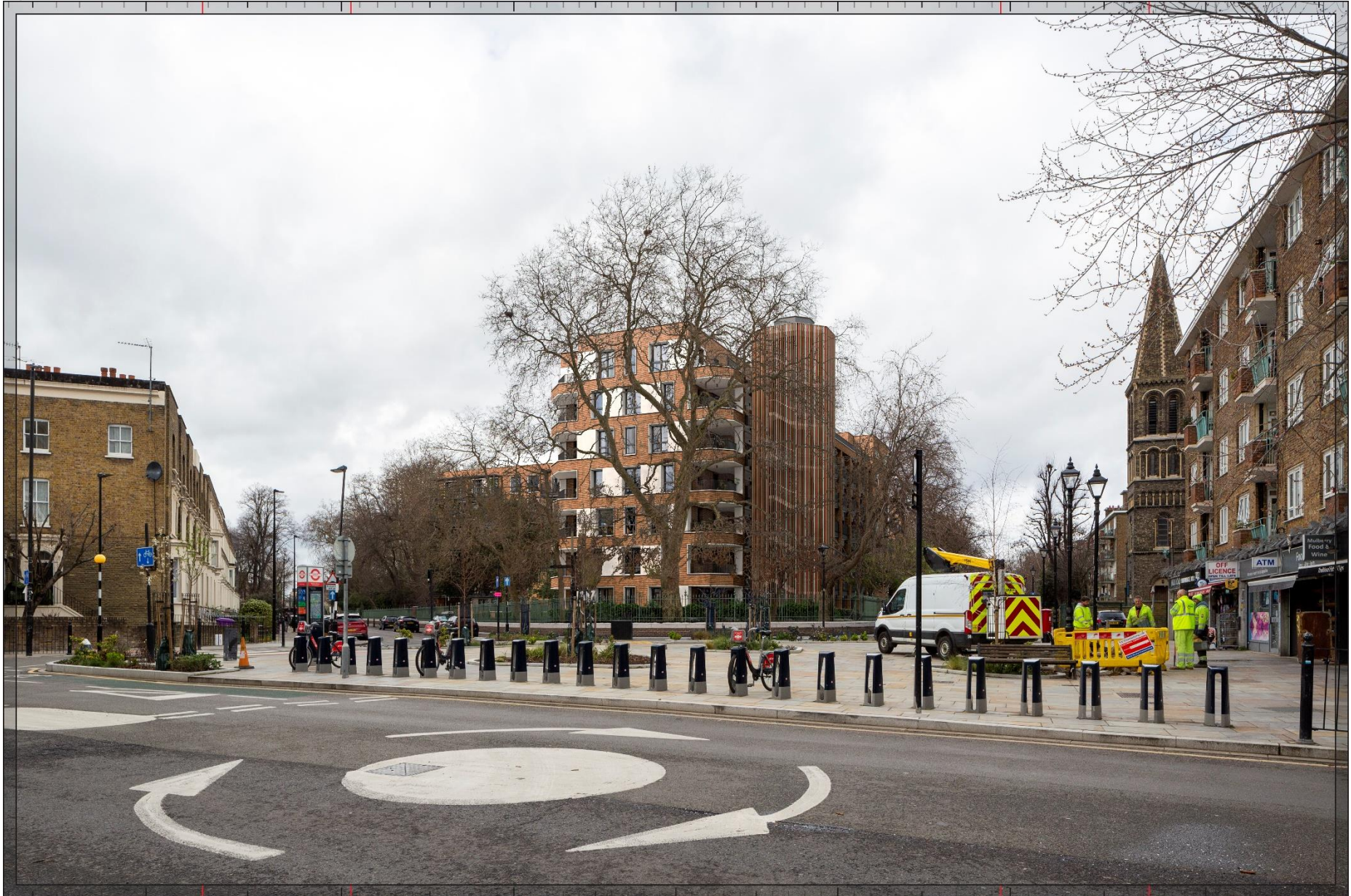
Updated View 4