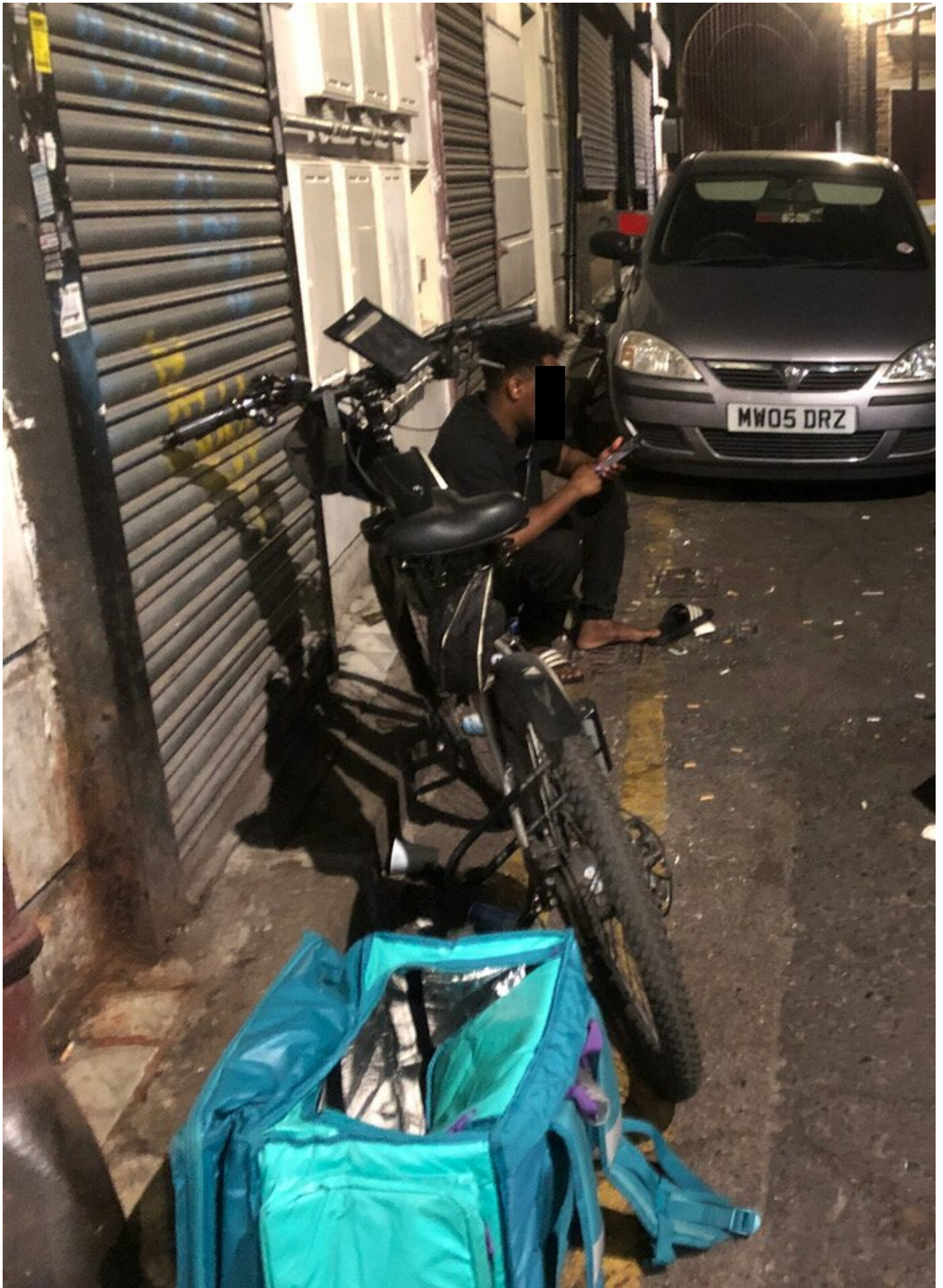
PARKED CAR FROM 14:00 STILL THERE AFTER 24:00 STILL COMPLETELY BLOCKING THE ROAD BUT THE COUNCIL DOES NOTHING!