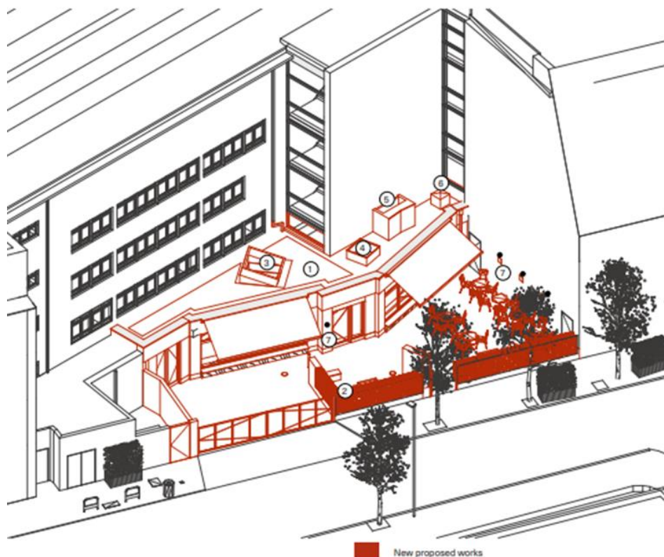
Fig.6 The proposed external works