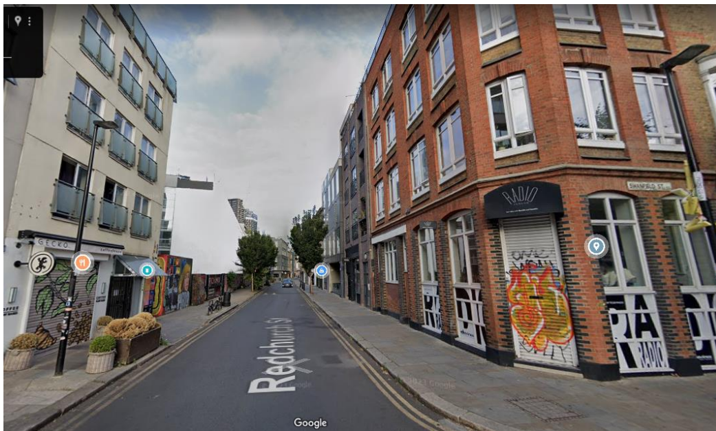
Fig. 7 View along Redchurch Street from the east. Rich Mix servicing yard on the left. Mixed-use (commercial and residential) properties opposite, on the right

7.22 In response to the public consultation the Council has received letters of objection from 28 local residents. Letters have been received from residents at 85 and 89 Redchurch Street, which are immediately opposite the Rich Mix servicing and delivery yard. Letters have been received from residents with addresses in other parts of the borough. In respect of noise and disturbance, the objection letters relate to the potential impact of the proposals on the character of Redchurch Street more generally and the noise disturbance to neighbouring residential properties.