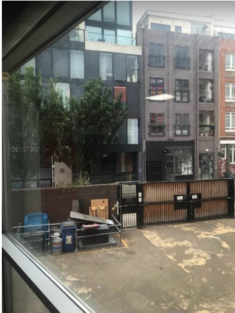
Fig. 8 View of the existing servicing yard and mixed-use (commercial and residential) properties opposite.

7.23 The main aspects of the proposals that have the potential for noise and disturbance to residents are as follows: