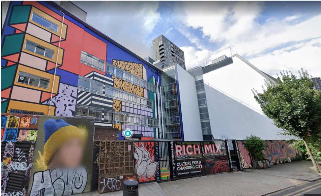
Fig. 2 Streetview of the site from Redchurch Street.