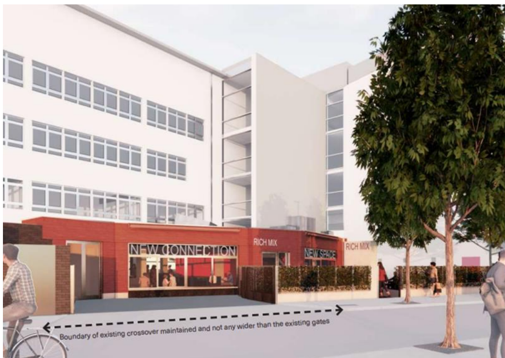
Fig. 5 Visualisation of the proposed external works