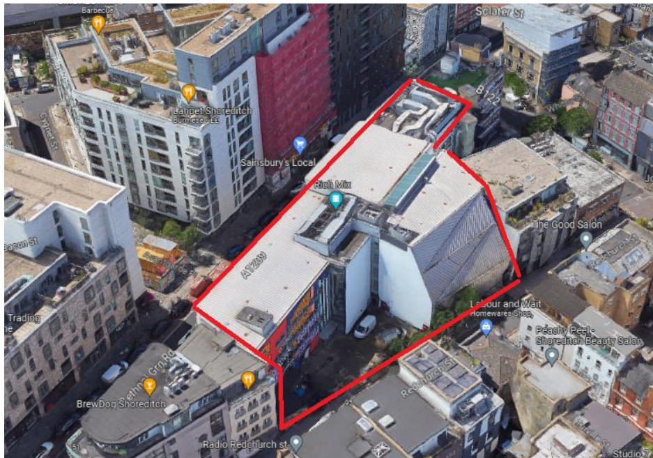
Fig. 3 Birds eye view of the site from the north-east.

1.4 The site previously was occupied by a leather maker's factory. Planning permission was granted in 2002 for conversion and extension of the factory to provide the Rich Mix centre.