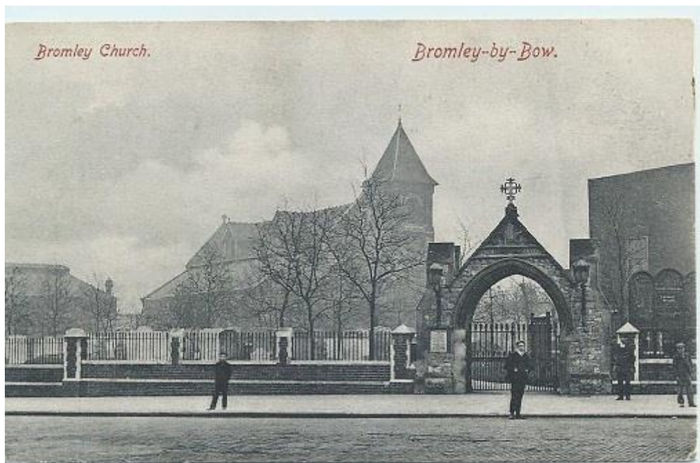
3.3 The gateway is grade II listed and currently sits on Historic England's Heritage at Risk register.