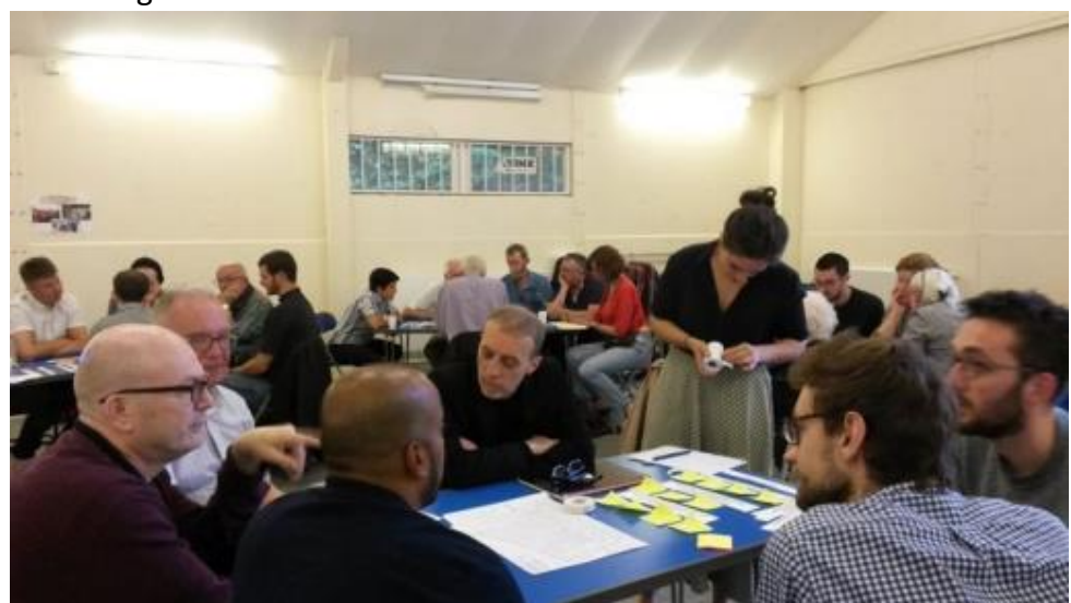
A local engagement event discussing the plan area