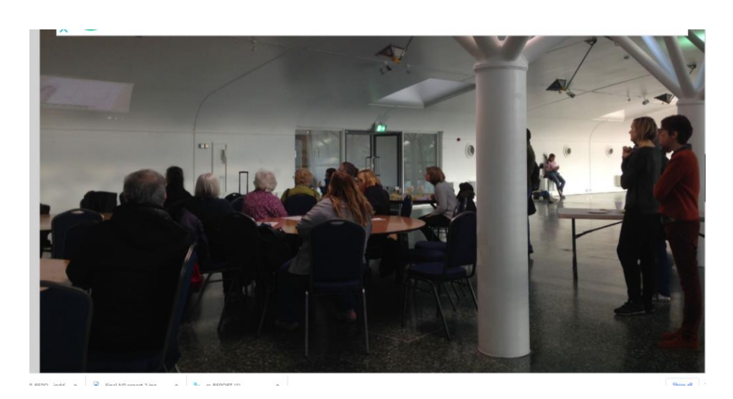
Antill & Meotra event in the Ecology Pavilion