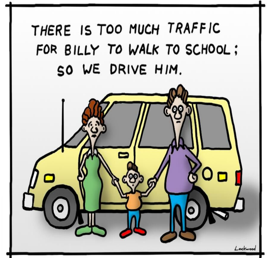
Traffic Inducing Traffic