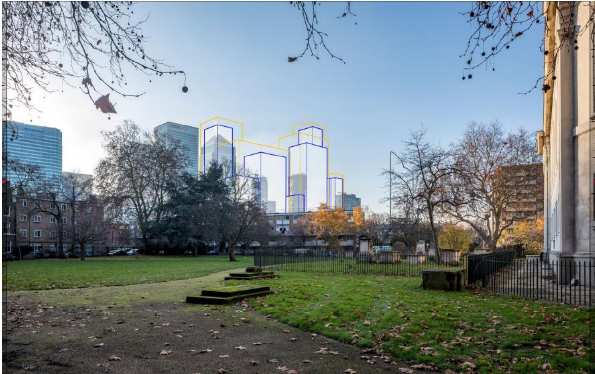
View from All Saints Churchyard. Yellow – maximum parameter. Blue – indicative.