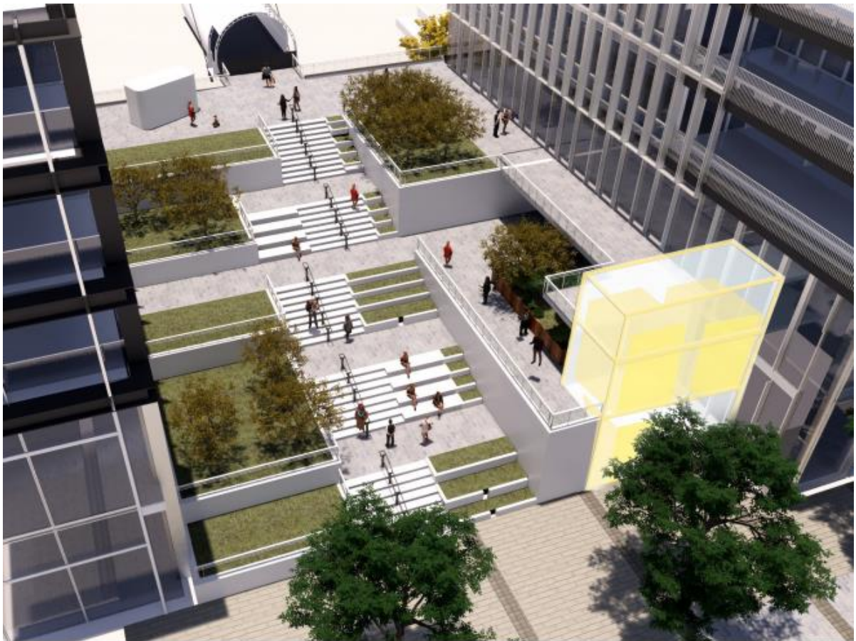
Indicative image of proposed connection to Poplar Footbridge