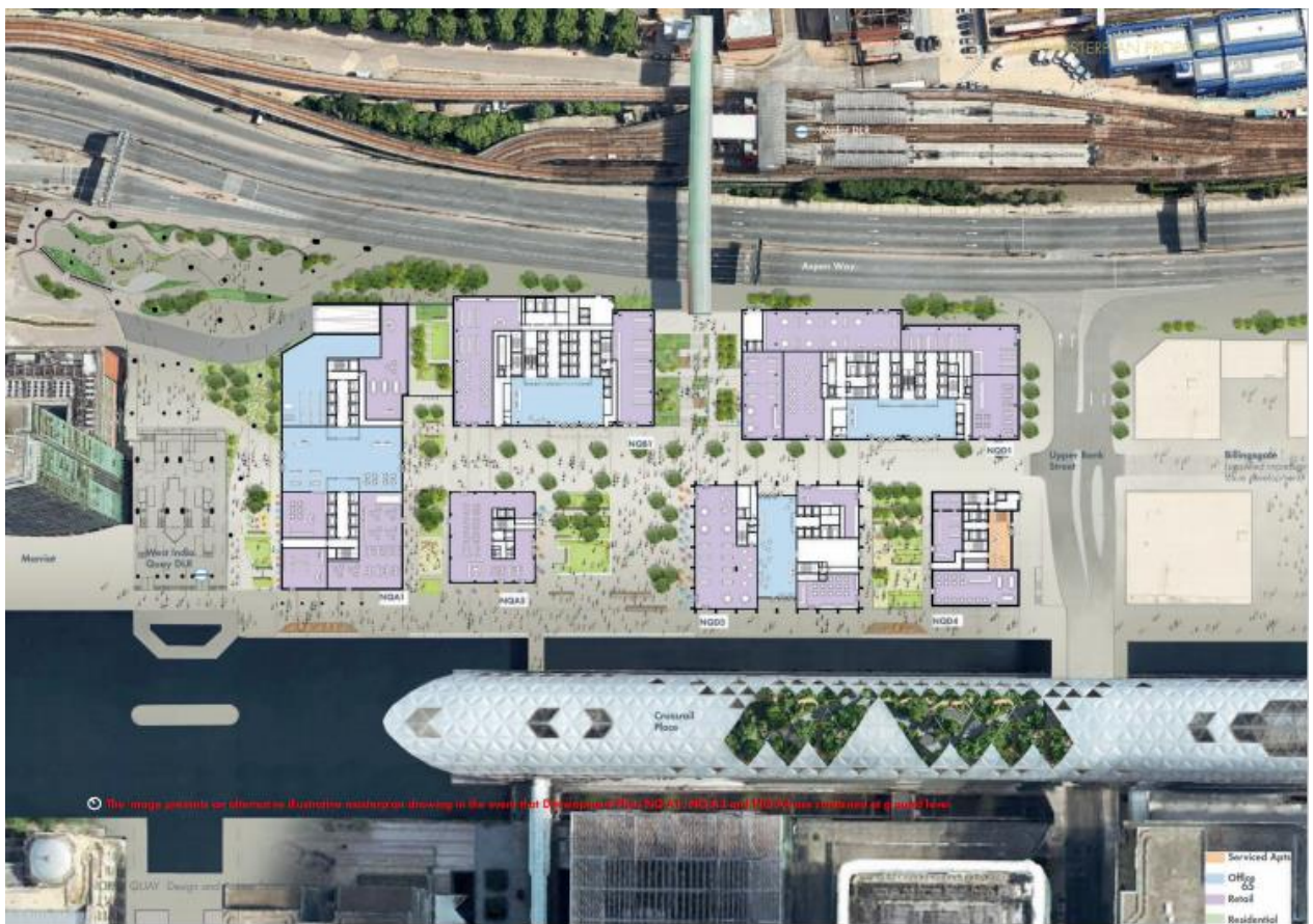
Indicative site layout with east/west 'North Quay Way' blocked at western end