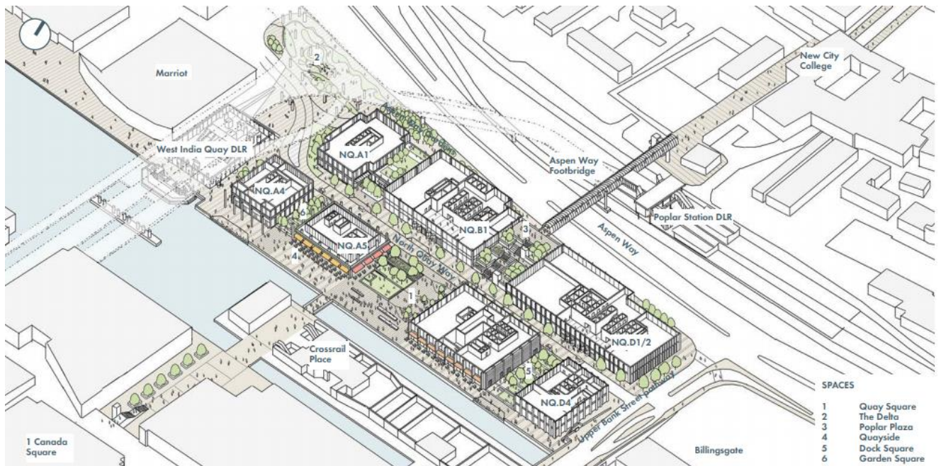
Indicative site layout