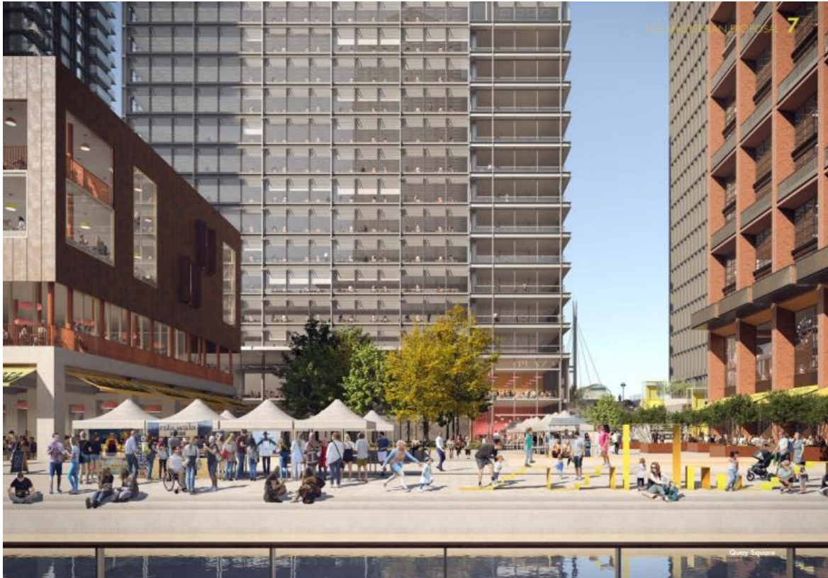
Indicative view of proposed 'North Quay Square' from dock