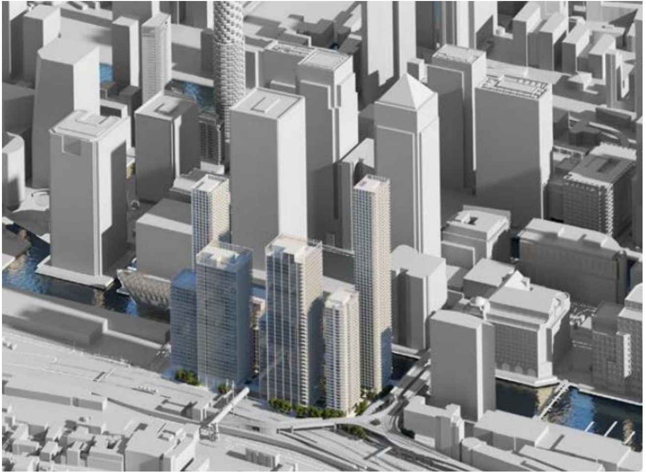
Indicative image of massing in wider Canary Warf context