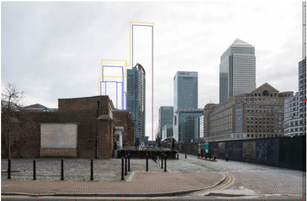
View from Cannon Workshops (west of site)