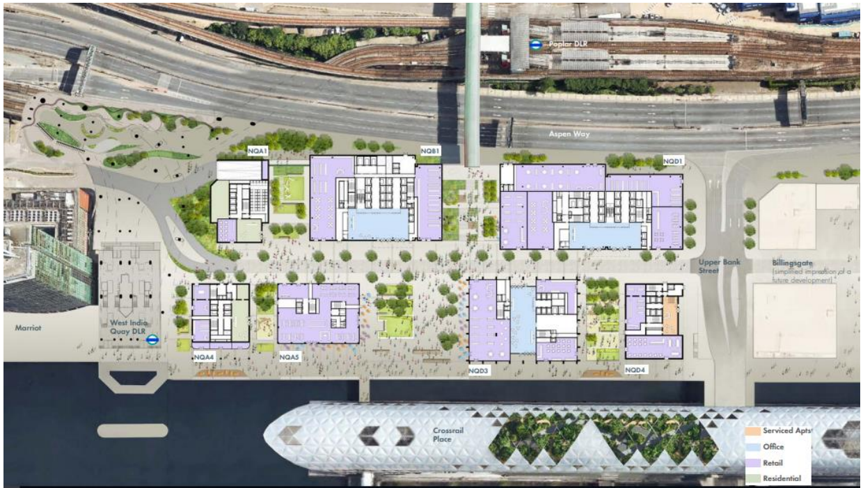
Indicative site layout