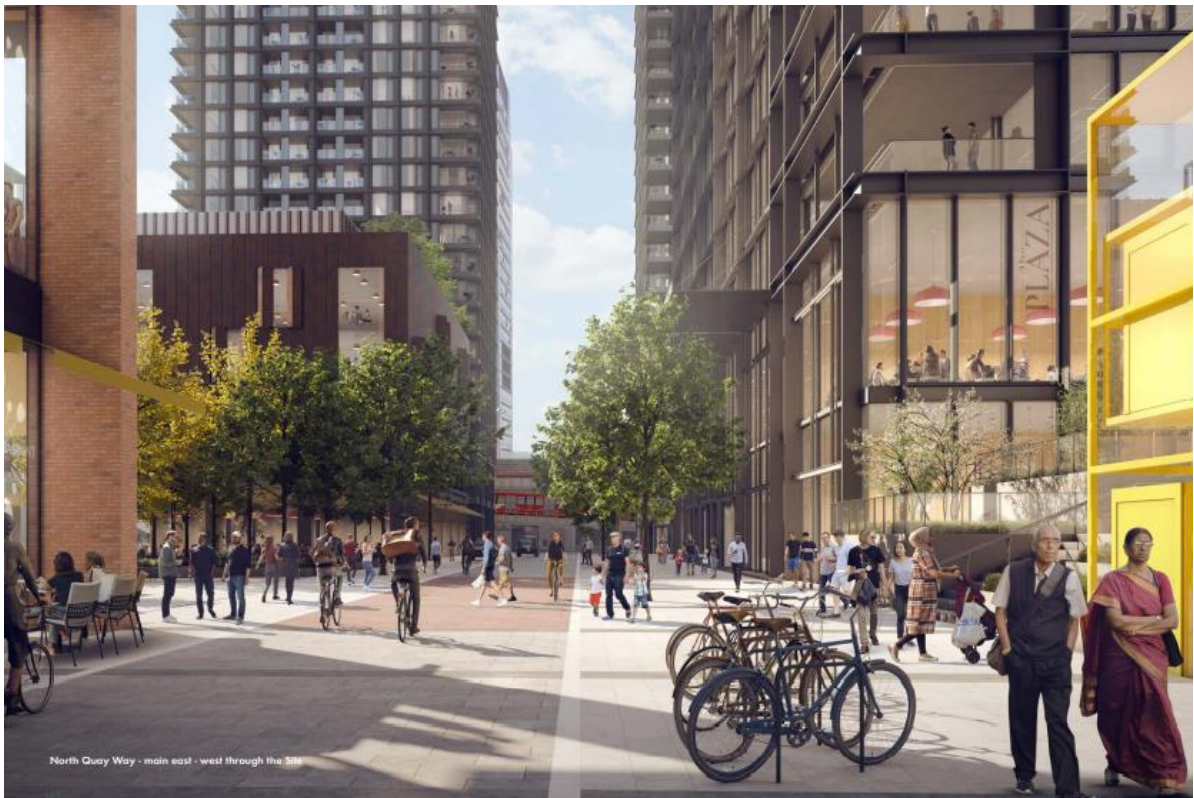
Indicative image of east/west 'North Quay Way'