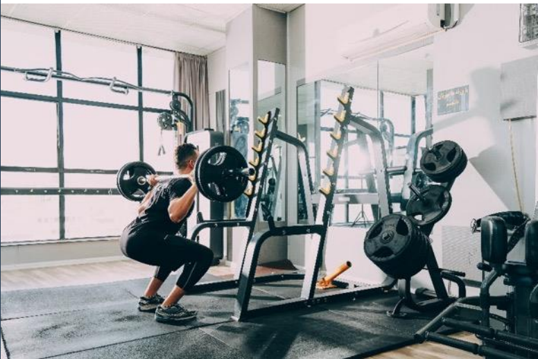
24-hour Fitness Centre