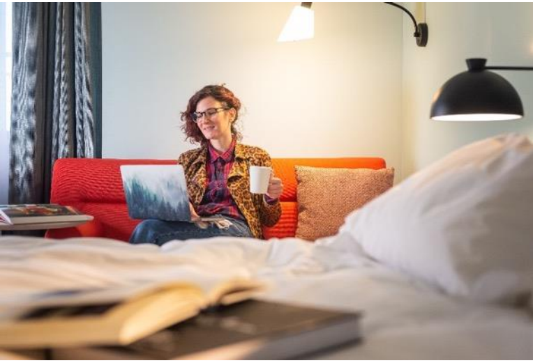
The Cozy Corner