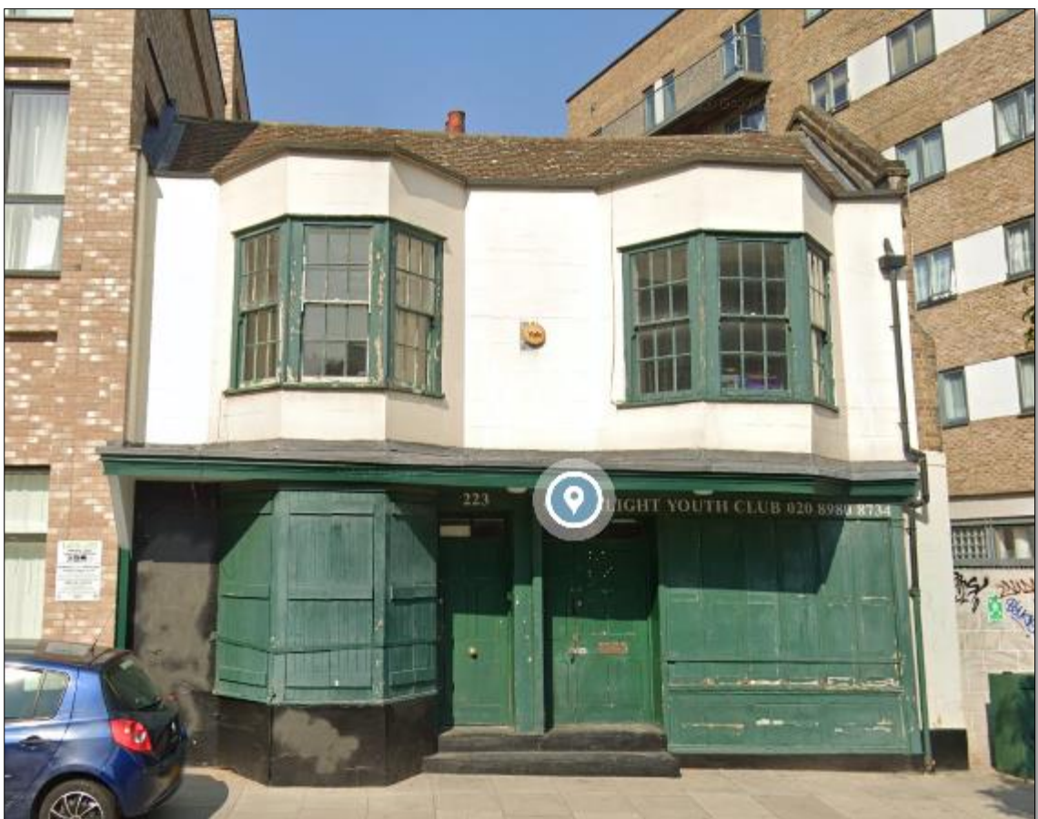
Fig. 1: Greenlight Youth Club