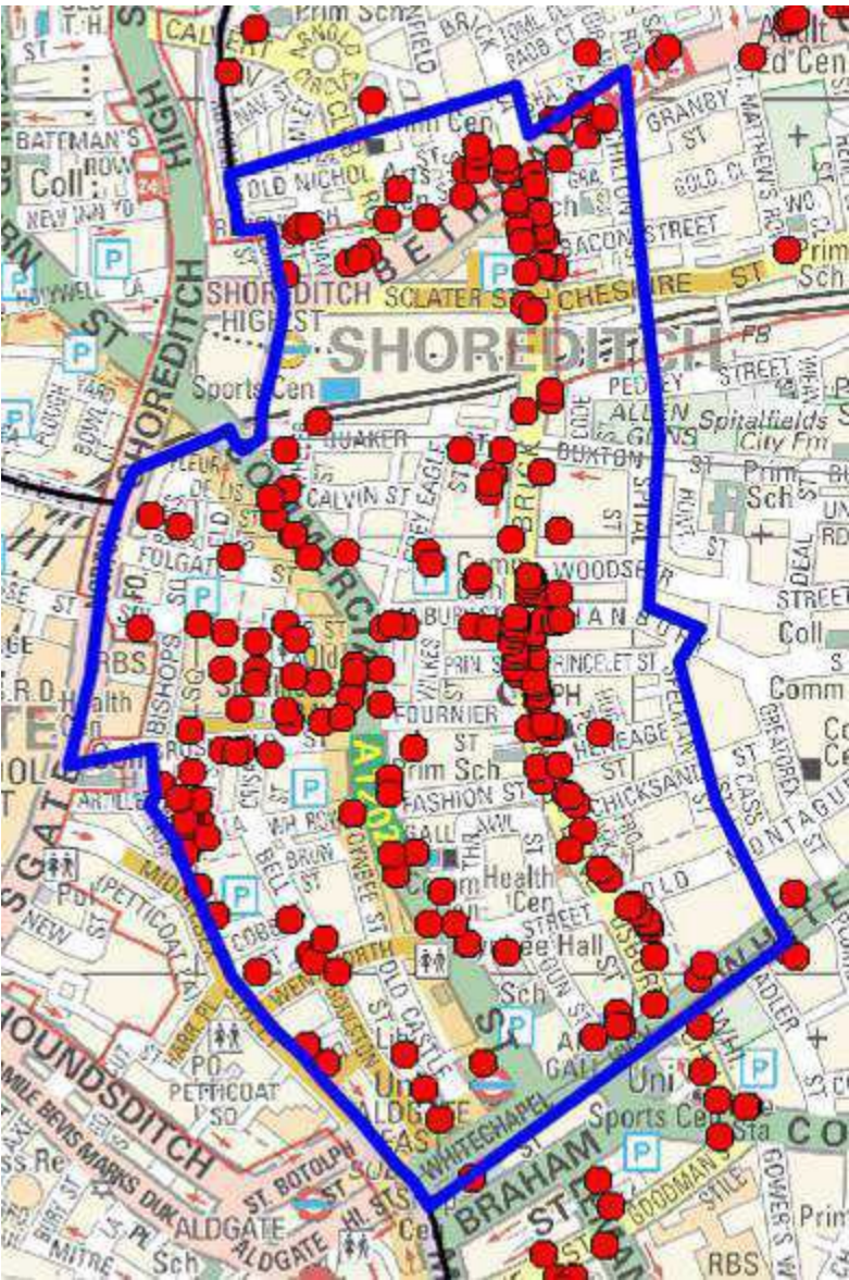
Map courtesy of Metropolitan Police