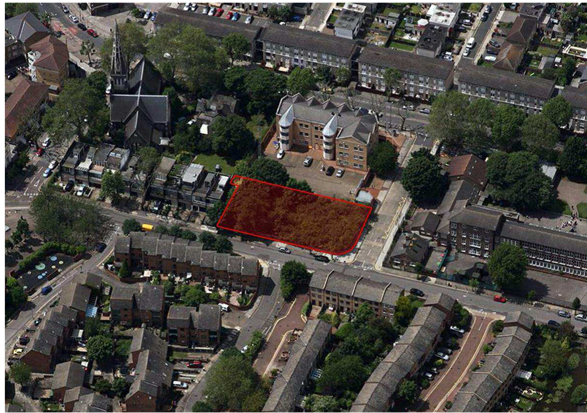
Figure 1. Site context