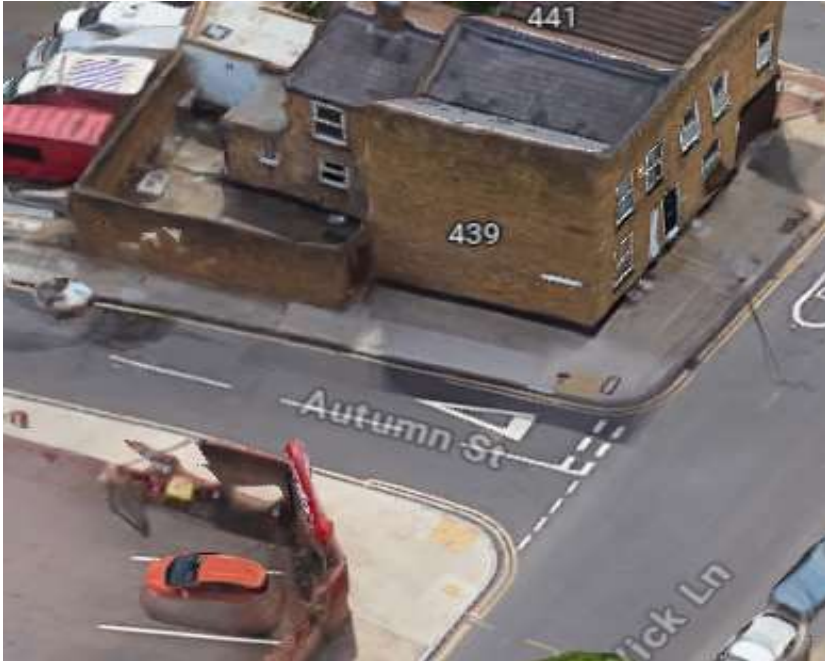
Image 1 - Corner of Wick Lane and Autumn Street close to residents