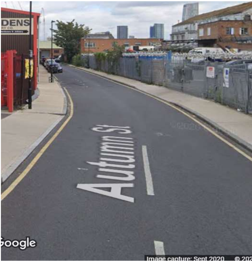
Image 2 - View of Autumn Street from the top of the road