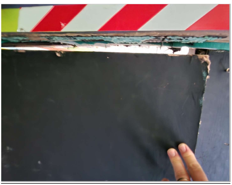
Police Photos – 90 White Post Lane