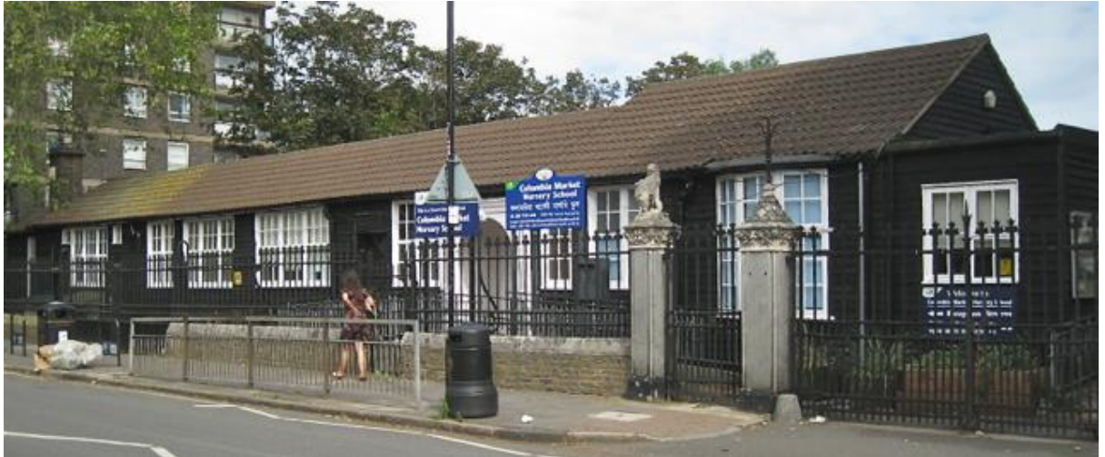
Figure 1: Columbia Market Nursery School today

reflecting shifting patterns of family life and concern for infant health and well-being. The building is of timber frame construction with weatherboarding and pitched tiled roofs, with unaltered folding partitions dating from 1935, which open onto an open courtyard. The building style is experimental for the time, using new materials and construction techniques not previously used, such as pre-fabrication.