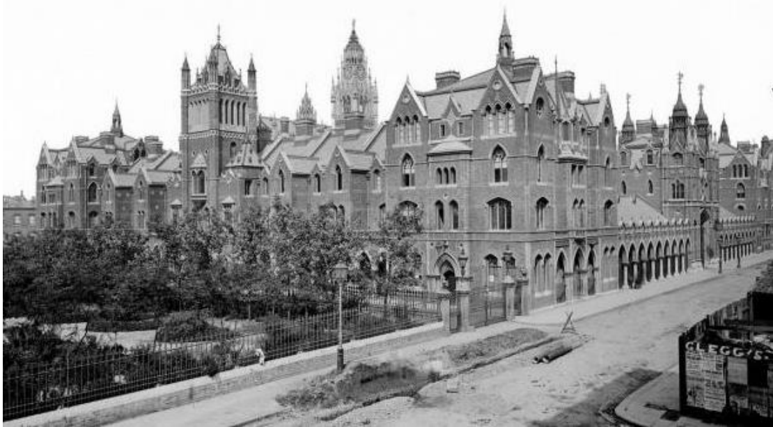
Figure 2: Columbia Market building (railings and gate piers to front) on Columbia Road (1870-1900)