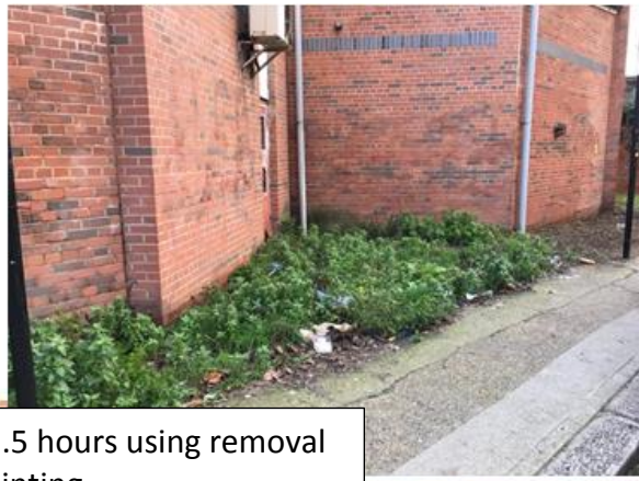
Whole job took 3.5 hours using removal chemicals and painting