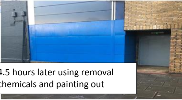
4.5 hours later using removal chemicals and painting out