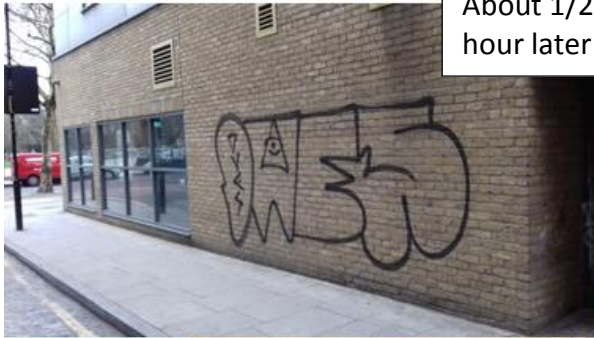
About 1/2 hour later