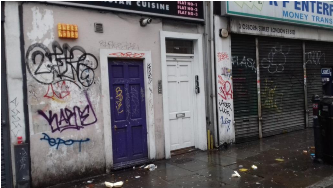
Typical example of graffiti we are removing from shop fronts and properties on highstreets