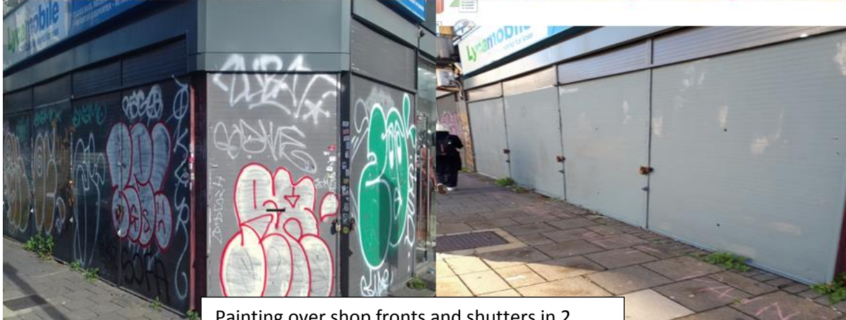
Painting over shop fronts and shutters in 2 hours.