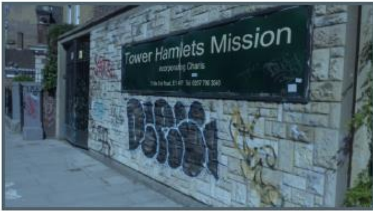
Tower Hamlets Mission, on Mile End Road - Clearing Graffiti from where it's not wanted Recent work to clean up outside of Tower Hamlets Mission which local residents were very pleased about, having put up with this for a long time