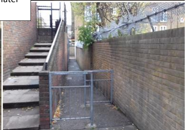
Clearance for the whole of Puma Court (walls and doors) and street furniture took approximately 5 hours.