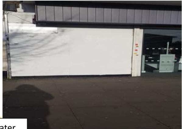
... 1 hour later for these