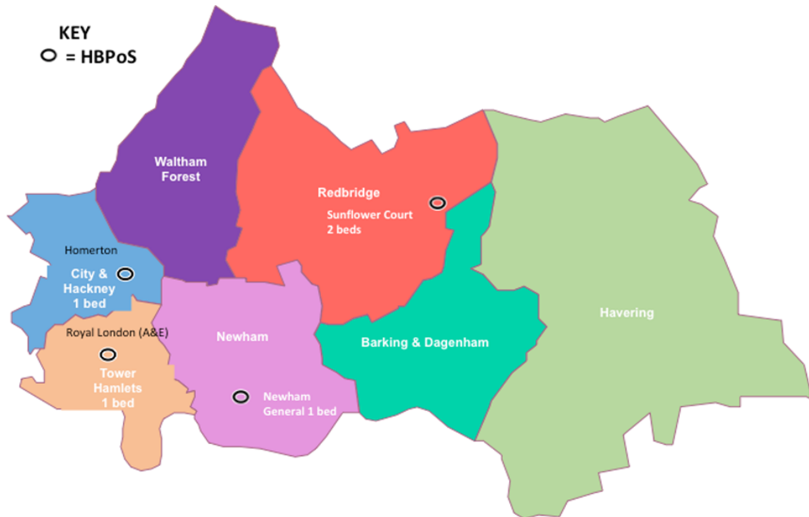
Figure 1 – Health Based Places of Safety within the North East London STP

3.2 Based on the case for change a three site HBPoS option will be developed, to commence from June 2019. North East London will therefore have 3 sites at :