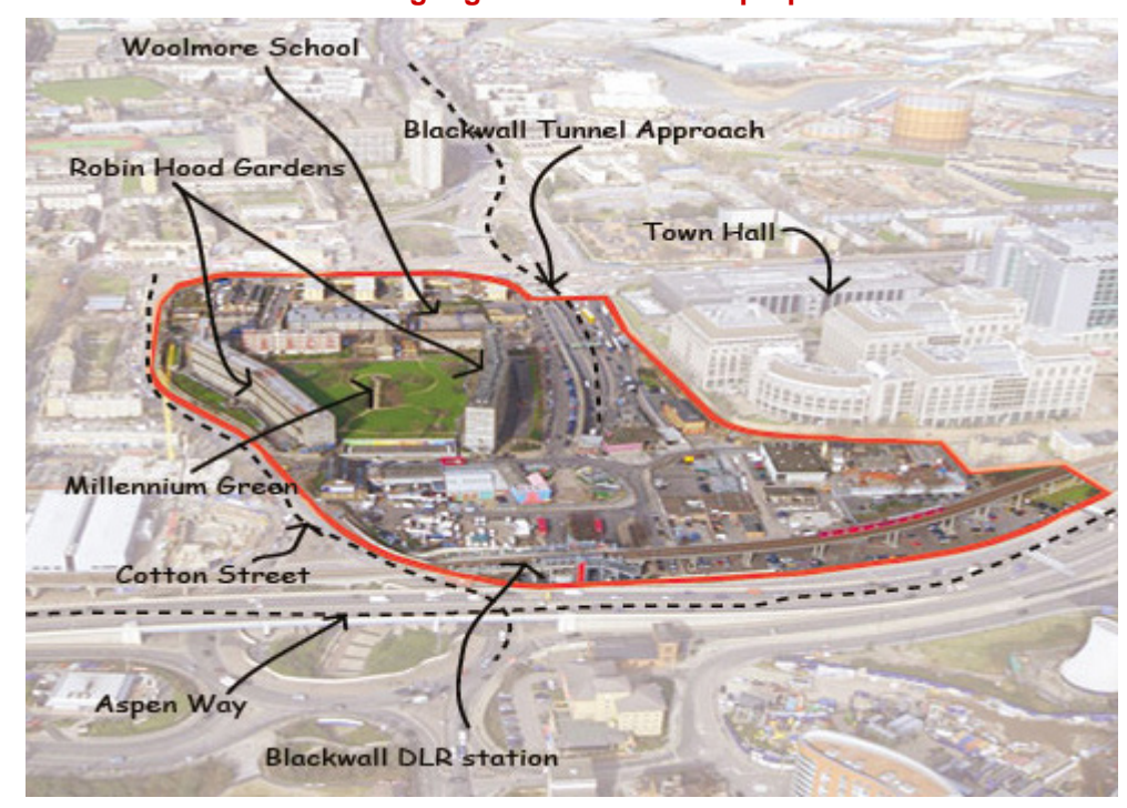
Aerial view showing regeneration area for purpose of consultation:

1.2 Blackwall Reach Regeneration Project is the name given for the 'regeneration' of private and public sector land in the area of Robin Hood Gardens in Tower Hamlets Borough. Blackwall Reach is a small, neighbourhood with worn out buildings, isolated by major roads on all four sides and home to approximately 300 households, predominantly from the Bangladeshi community, many of whom have lived there for many years: