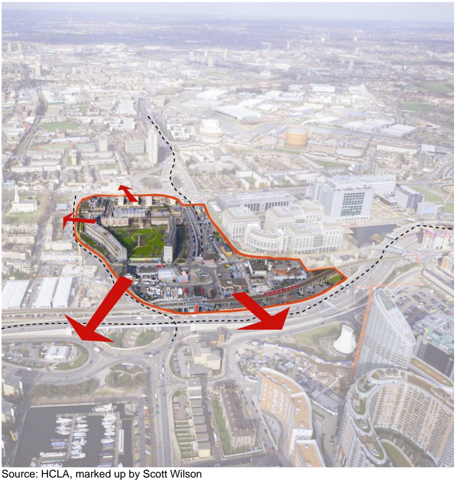
Diagram 1: Problematic access points according to residents