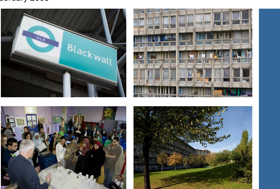
Report February 2008