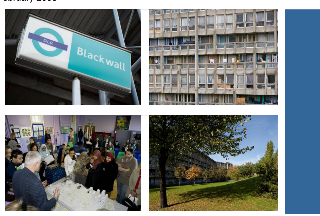
Report February 2008

Stage 1A: Statement of Community Participation – Phase 1 Consultation